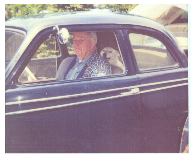
Three Champions -A man, his Dog, his car

Although the car is now drivable, it will probably not go on any major road trips.