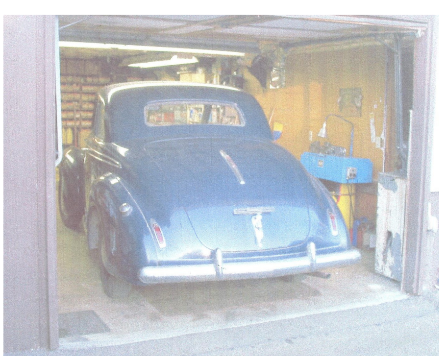
The Champ;s third Garage Home in Seventy-One years