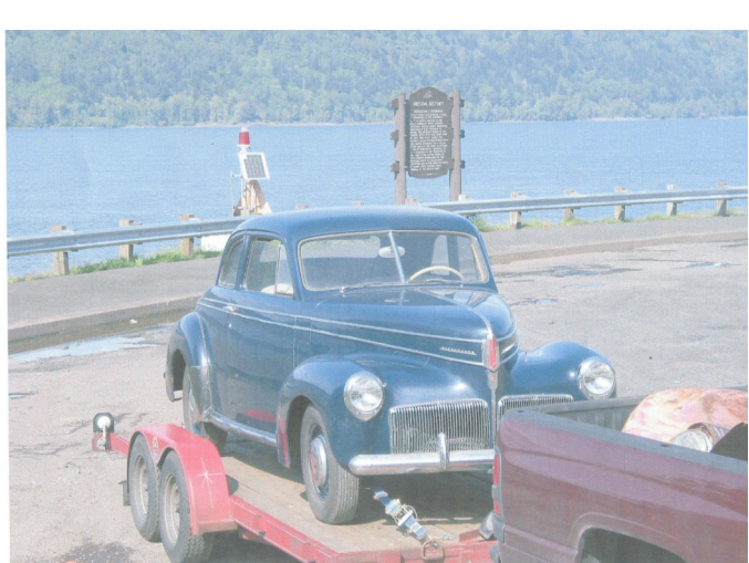
One last look at the Columbia

A brief stop for one last look at the Colombia River where the little coupe had spent its