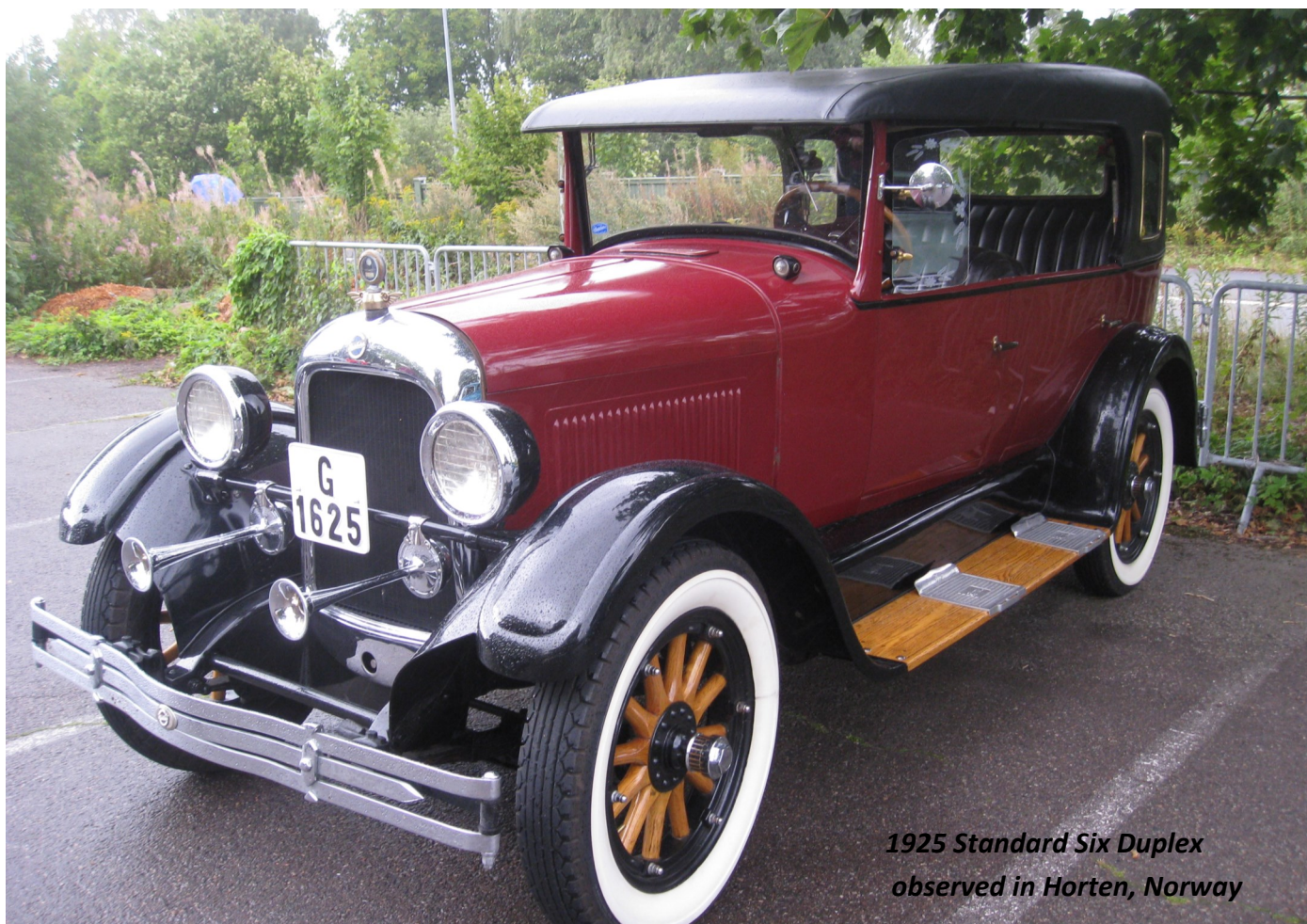
1925 Standard Six Duplex observed in Horten, Norway