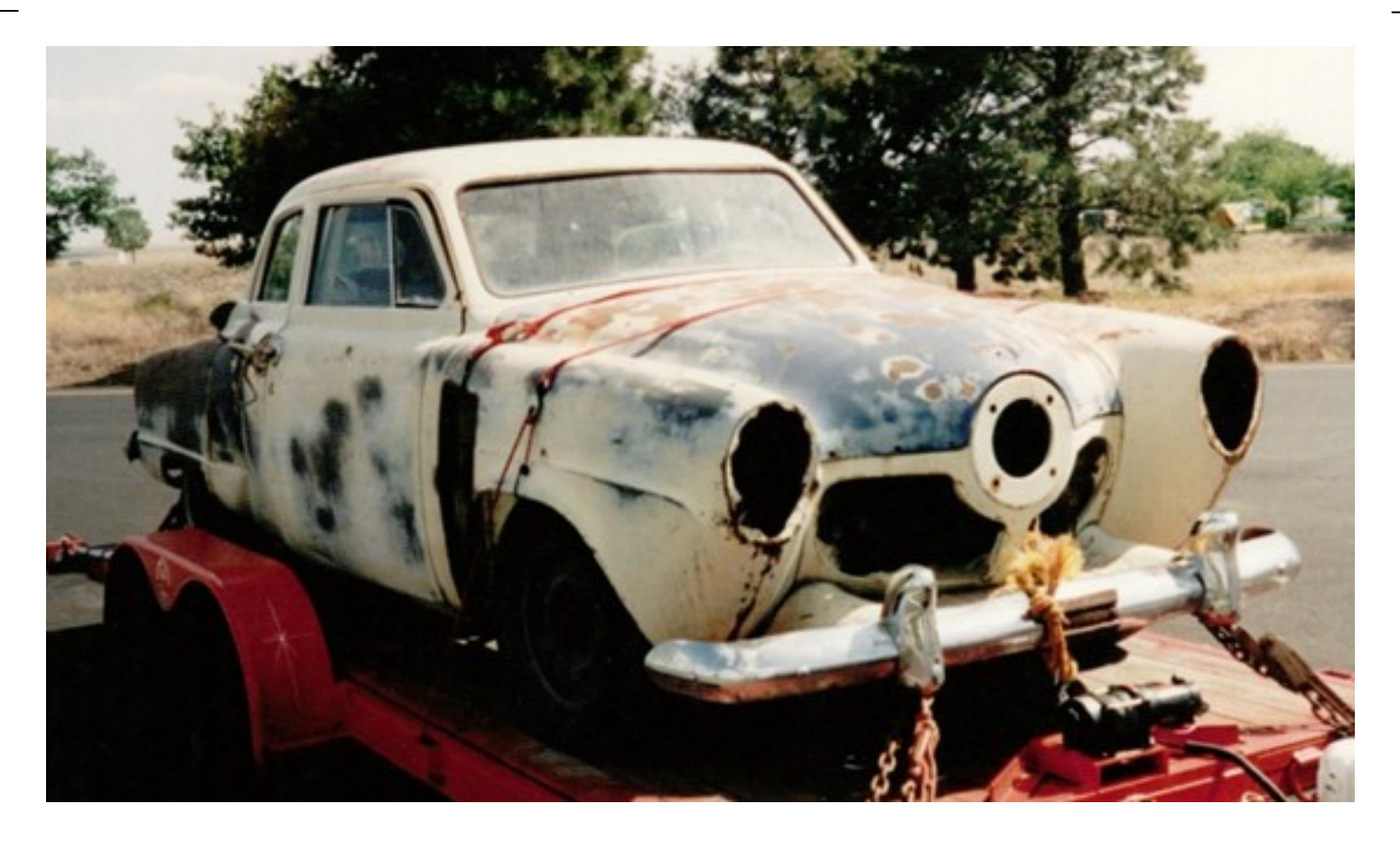
The '51 parts car that came with the '51 convertible basket case. See inside for story