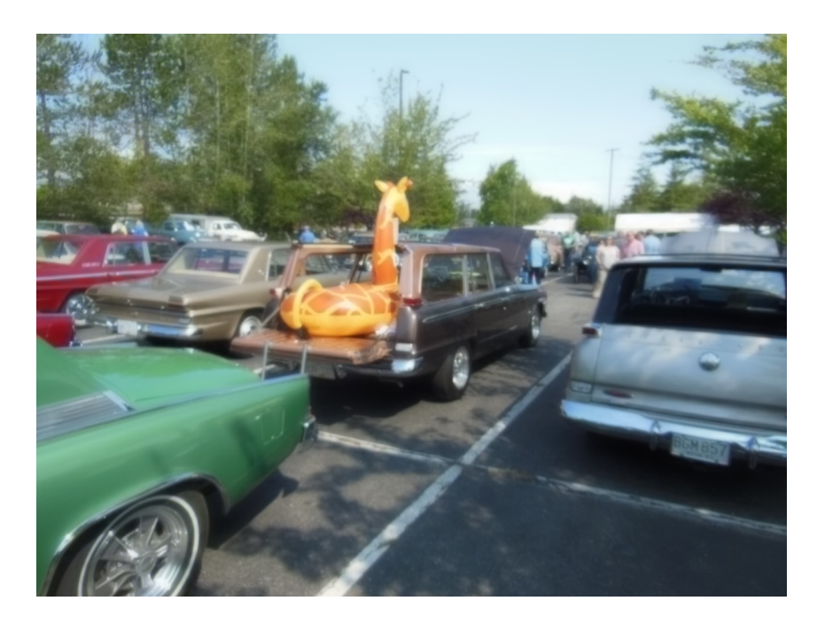
Some shots from the Can-Am