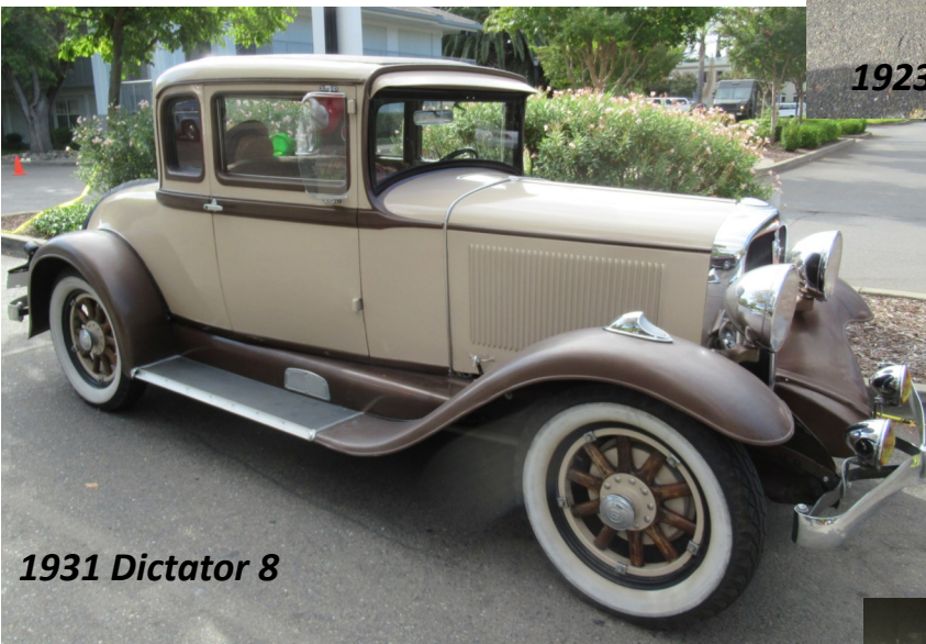
1931 Dictator 8