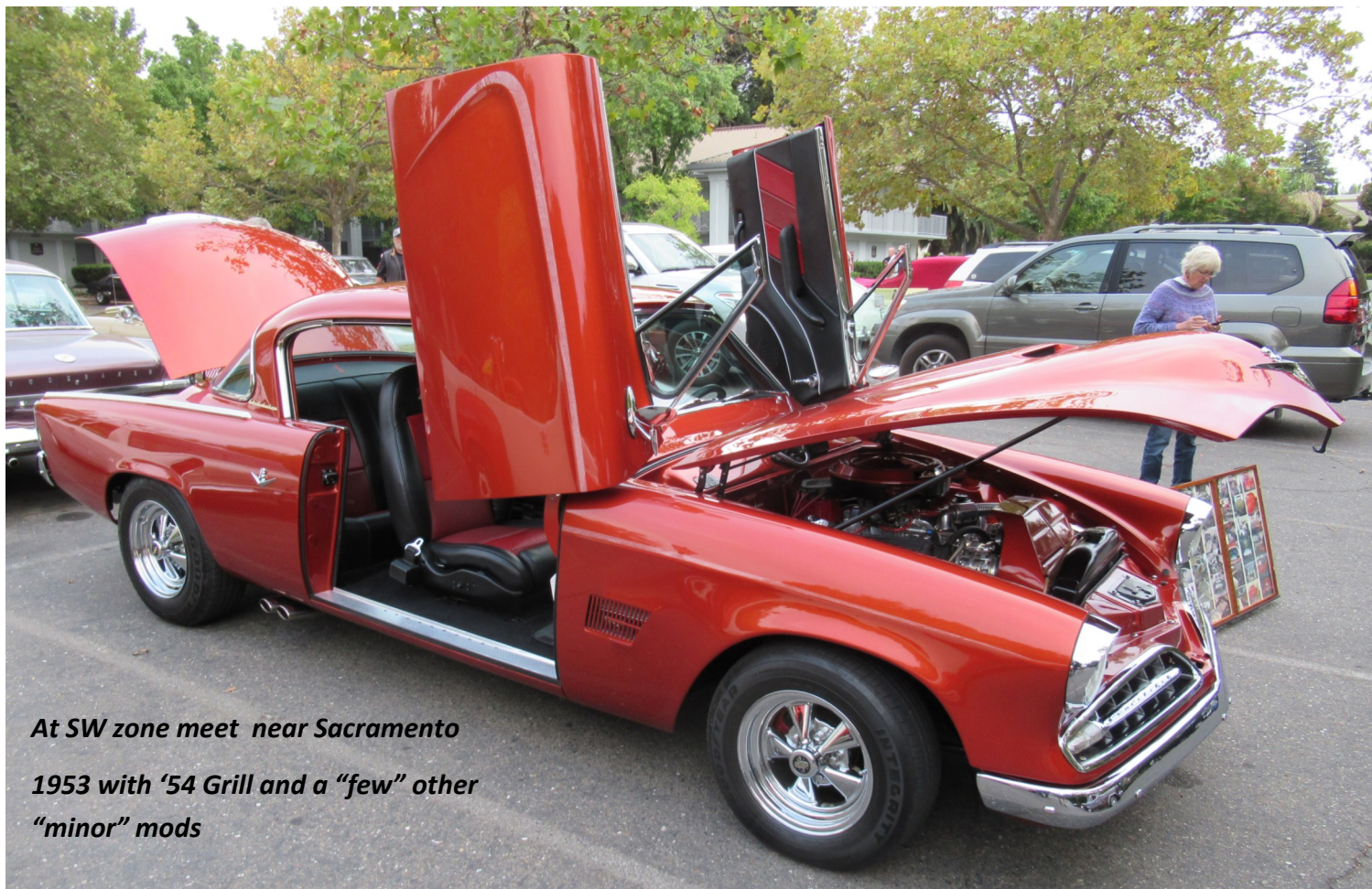
At SW zone meet near Sacramento 1953 with '54 Grill and a "few" other "minor" mods