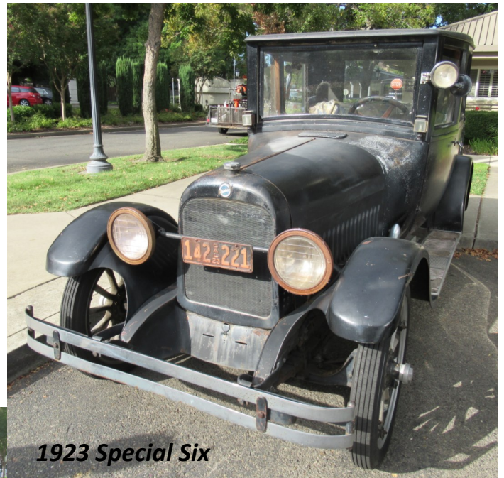
1923 Special Six

It took us 2 days to get to the meet. Nice warm