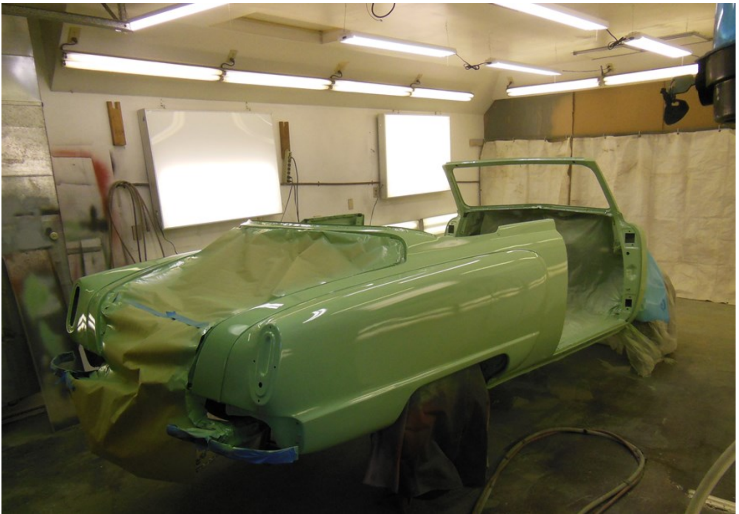
Finally getting paint on the body