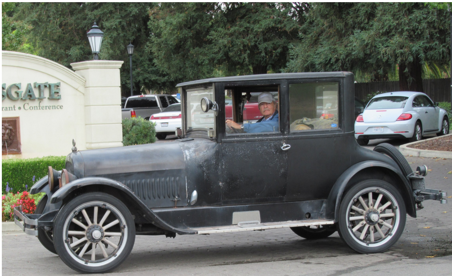
Seen at the SW Zone meet in Sacramento