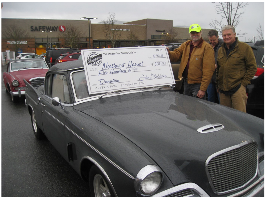
From the NW Harvest donation in Issaquah and the Christmas party in Everett