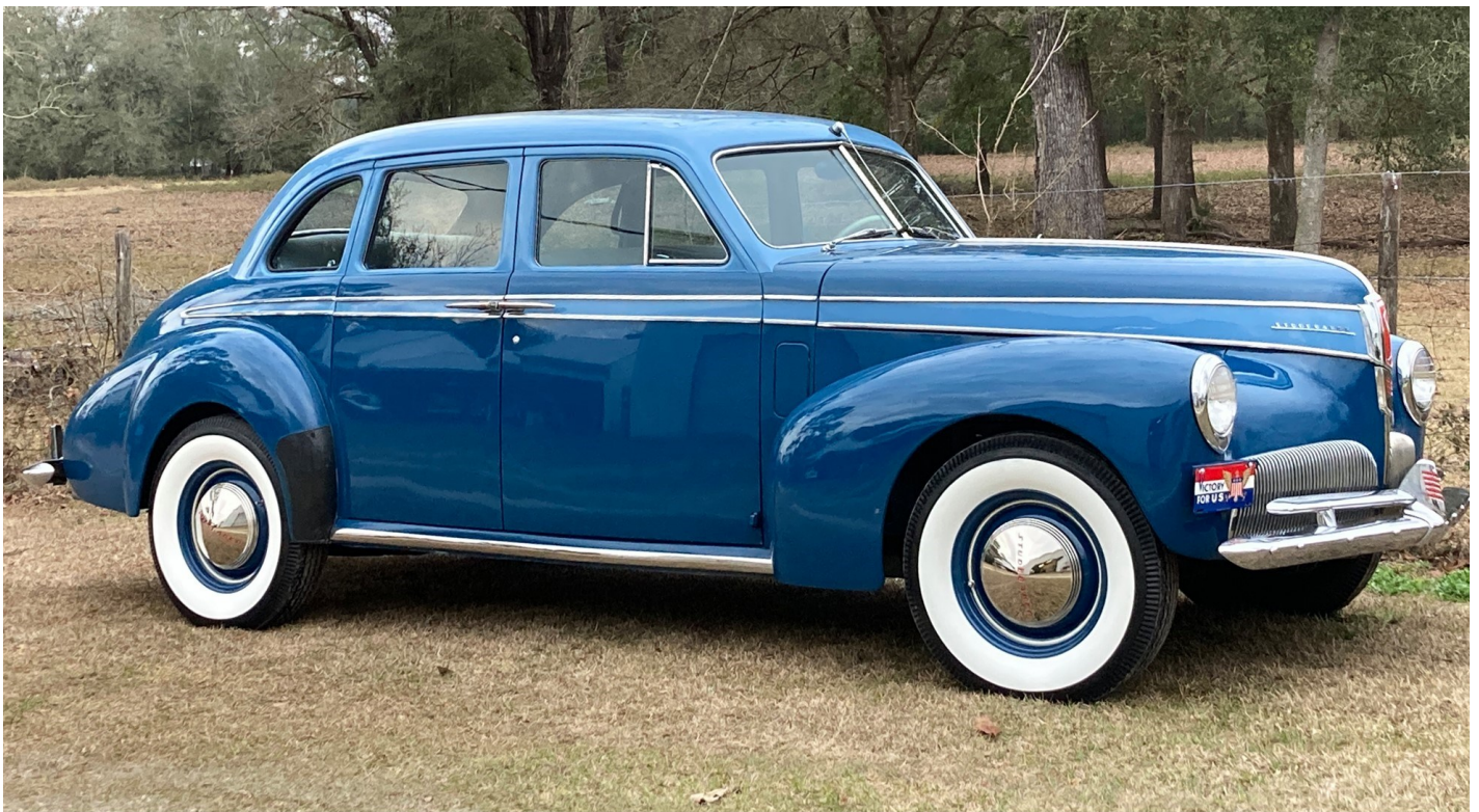
From Kelstrom. This 1941 used to be Al Ticknor's car. Now located in Florida